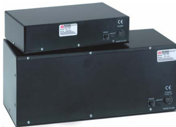
Rear view of MultiStation models ML-2U and ML-4U

■ Phone: 281-933-7673 ■ E-mail: sales@rose.com ■