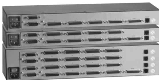
Rear view - UC1 1x4, 1x8, 1x16

■ Phone: 281-933-7673 ■ E-mail: sales@rose.com ■